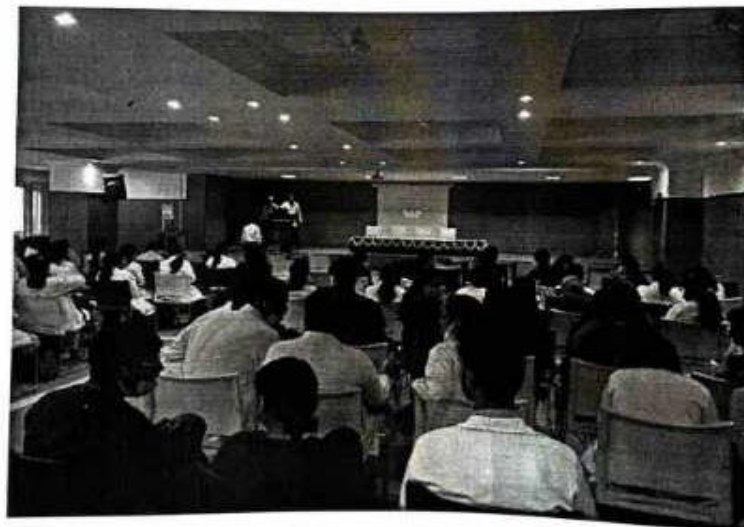
Audience assembled for Antiragging committee meeting