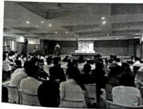
Audience assembled for Sexual harassment elimination committee meeting and