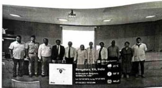
Antiragging committee with the resource persons for prevention of ragging